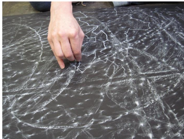
FIGURES 1 AND 2: DIRECTIVES ONE AND TWO, UNIVERSITY OF OKLAHOMA