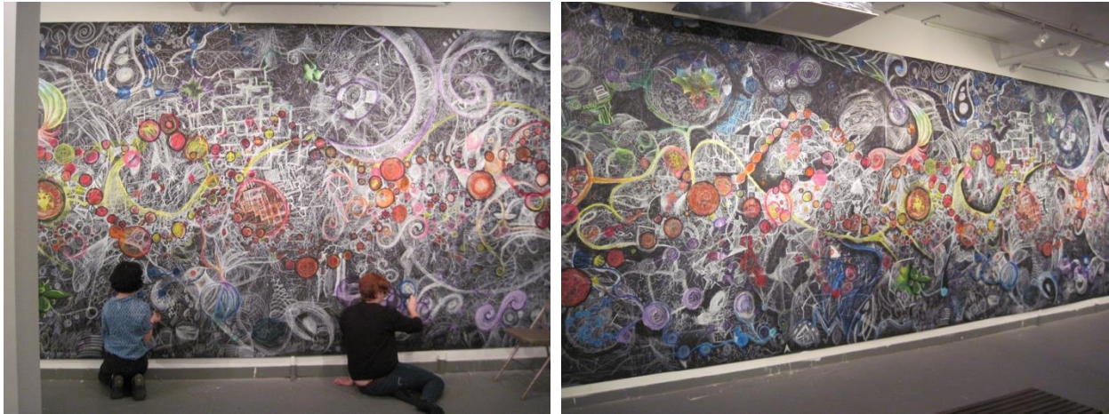
FIGURES 9 AND 10: DIRECTIVE FIVE, PRINCETON HIGH SCHOOL

Seen from the perspective gained at the conclusion of this sequence of drawing experiences, the Gadamerian position on game-play and the experience of an artwork now appears even more relevant: