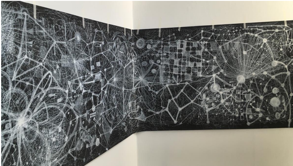
FIGURE 6: DIRECTIVE 4, LOUGHBOROUGH UNIVERSITY