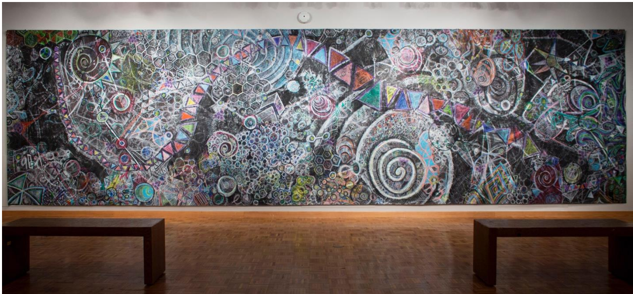
FIGURE 11: COMMON GESTURE DRAWING, UNIVERSITY OF WISCONSIN – OSHKOSH

As drawing does more than illustrate a concept, it can enact the idea itself within, through, and often well after, the time of its making. Each Common Gesture drawing I have facilitated has afforded multiple glimpses into how this particular sequence of drawn actions performs and embodies ideas including, and beyond, the phenomenological. While these collaborative drawings are generally humble in their ambition and execution, they can nonetheless birth and nurture concepts with deep roots in the history of thought, manifest within their lifespan. When taken within the context of the 2017 TRACEY Conference, the drawing afforded a unique opportunity to draw (from) an experience in common.