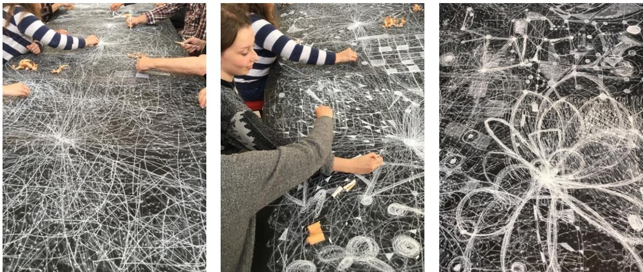
FIGURES 3, 4, 5: DIRECTIVES 3 AND 4, LOUGHBOROUGH UNIVERSITY

At the conclusion of fifteen minutes, each pair of drawers must join with an adjacent pair to negotiate how their two separate games may be combined into one. Rules evolve, emerge, drop away, or are reconfigured to allow the foursome to play the new drawing game together for another fifteen to twenty minutes. Here, the marks are often at their most liberated, complex, and expressive. The games generate geometric figures, elaborate visual patterns, bodily outlines, scrawled signatures, renderings of realistic subject matter, combinations of letters and numbers, all manifesting as self-contained logics of play. Play is continued until the surface is layered with the visual traces of collective gaming. The material of the wax crayon is such that all traces are visible, with accumulation being the only method of obscuring a mark.