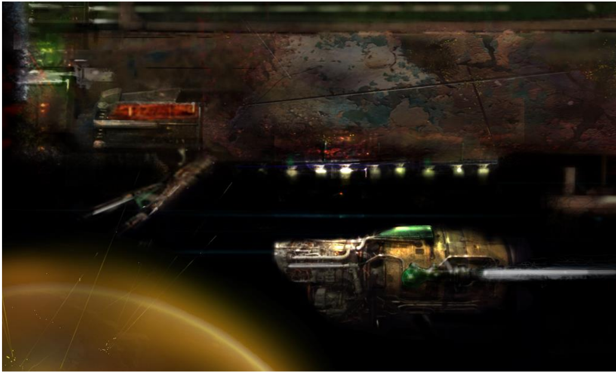
FIGURE 4. WORKED UP SKETCH USING IPAD.

In the last six months his attitude to the iPad has changed. “I haven’t used the drawing application on iPad for awhile, I’ve forgotten half the shortcuts, sequences that made the thing fluid” (Firth interview). Many of his designs for the digital games originated in sketchbooks and then digitally captured to be worked up using Adobe software (see figure 3 and 4). The screen began to represent “work”, and the paper sketchbook was “relaxation”, therapeutic, “time out to reflect, like a roll-up cigarette, a meander”. As a starting point for creative thought the physical sketchbook could always be relied upon. For solving problems visually a sketchbook is direct and immediate, from mind to paper. As a teaching tool the paper sketchbook remains indispensable.