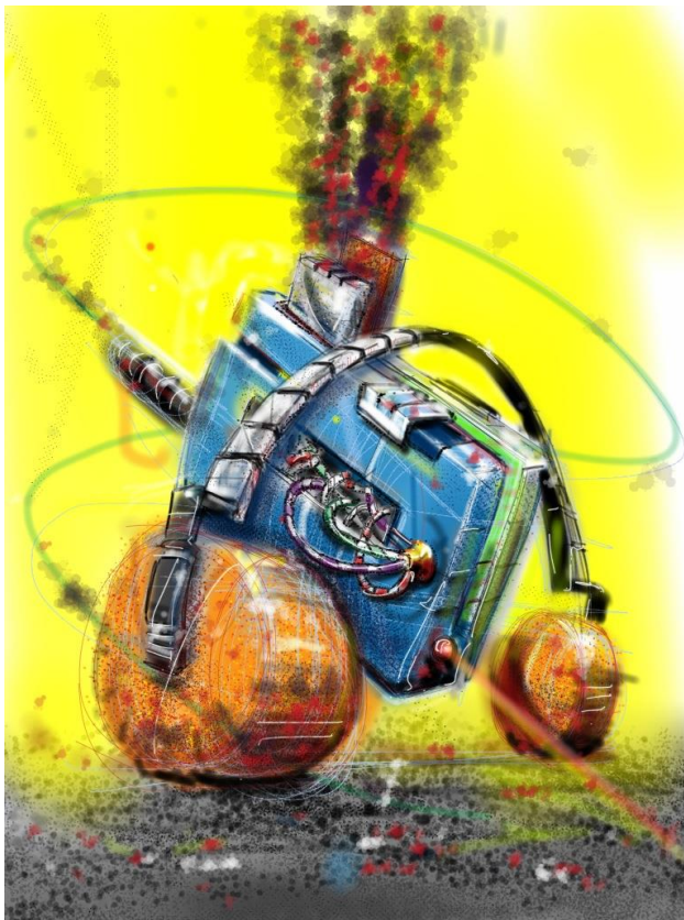
FIGURE 2. ROBOT DRAWN USING AN IPAD

For eighteen months Firth has been working with an iPad and has recorded how it has affected his sketchbook activity. As a compulsive drawer he quickly mastered the drawing applications on the iPad favouring Sketchbook Pro because the interface was the most intuitive and the iconography was similar to other professional design software compared to the competition. While we were on a long train journey I watched him doodle and sketch up fantasy designs for futuristic robots (see figure 2). He was enjoying the freedom and elasticity of sampling textures and patterns from photographic media that could be employed as brush textures in his digital drawings. Carried by the novelty of a new toy he persevered with learning the new digital tools and developed his own short cuts and