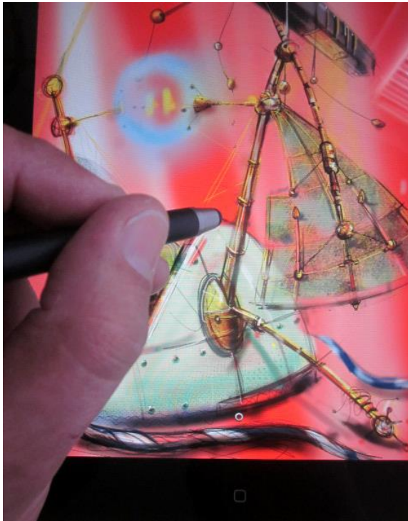
FIGURE 1. DRAWING ON AN IPAD.

Firth's approach to drawing in digital and paper sketchbooks provides an example of how a designer can find new ways of thinking. Both Bolt (2011) and Krcma (2010) use William Kentrige to illustrate a Heideggerian theoretical understanding of creative practice that comes from our "concernful dealings with our materials" (Bolt, 2011, p.94). Similarly Firth exploits opportunities where he finds new ways of thinking through the act of drawing. Firth recognises the difference in the digital and paper materials when it comes to making mistakes. Cochrane similarly reflects that the evidence of these mistakes can sometimes be "painful" in physical sketchbooks. Firth draws directly on a digital screen using an Apple iPad (see figure 1), but finds that the drawing "lacks the scars of the thinking process" (Firth interview) which would normally be evident in a drawing on paper. These scars represent points of learning, and act as reference points of thinking and mark the living experience with the medium. It is "the contingency of circumstance" and the "interference" of material process (Krcma, 2010), which encourage what art historian Barbara Maria Stafford has called "nonformalizable moments of flexible insight" (Stafford, 1999, p.198).