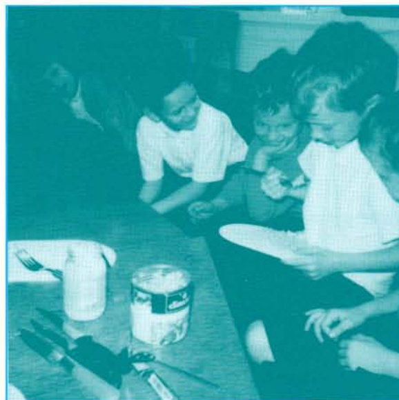
Figure 1: Children engaged in investigating, disassembling and evaluating products.

this way it was hoped that each group would produce a different style of sandwich with a range of ingredients. In addition, the degree of teacher intervention offered to children at the making stage of the assignment was not as direct as it had been during the IDEAs and the FPTs again allowing for more independent decision making by the children.