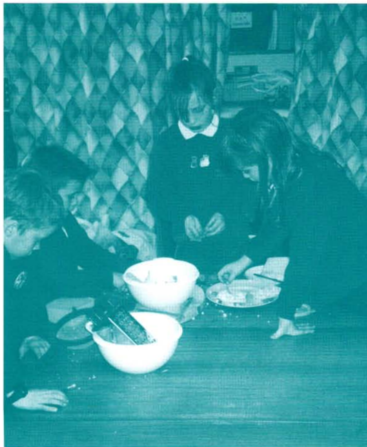
Figure 3: Examples of planning, designing and making as a team.

‘Design and technology provides rich opportunities for questioning, discussion, describing and explaining in both concrete and abstract forms.’ (Breckon, 1997: 15)